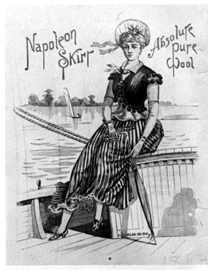
Advertising card from the Napoleon Woolen Mill. Circa 1880.

The primary objective of this economic development chapter is to give public and private officials and County residents not only a snapshot of current and future economic development initiatives, but also to provide a wide array of recommendations and strategies to ensure that the economic development goals enumerated in this Plan are pursued. Indeed, this may not come easy. To be successful, they will need to be internalized within each of these individual entities as they promote their own unique economic development initiatives. This chapter should be used in conjunction with the existing land use and growth area maps included in the Land Use Chapter. This recommendations and initiatives identified in this chapter should also compliment the objectives highlighted in the newly adopted Napoleon Comprehensive Plan.